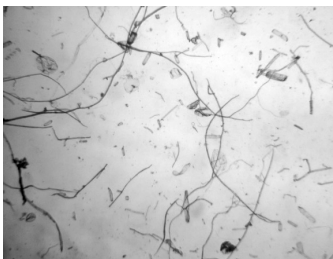
Figure 2: Microscopic view of Kans grass fiber

The plots for fiber length distribution and fiber width distribution for Kans grass fiber are based on the data generated by the Fiber Quality Analyzer, and presented in Figures 3 and 4.