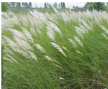
Figure 1: Kans grass in the field

(mL CSF), ISO-5267/2; pulp refining (PFI mill), ISO-5264; handsheet preparation, ISO-5269/1; burst index, ISO-2758; tear strength, ISO-1974; tensile index, ISO-1924; folding endurance, ISO-DIS-5626, and porosity, T-547-pm-88.