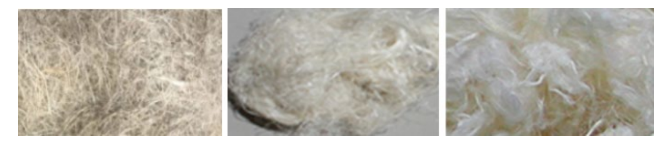
Figure 3: Raw hemp fiber (left), bleached raw hemp fiber (middle) and bleached modified hemp fiber (right)